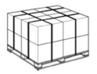
Expendable Palletized Load